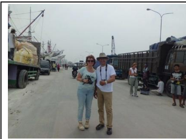
Sunda Kelapa Harbour