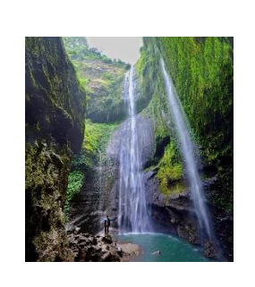
The most beautiful waterfall in Madakaripura

Picking up at Surabaya Pasar Turi Station. Upon arrival at Surabaya Train Station at 04:00 Am, we will provide a meeting service and a briefing from your Guide. Then we will proceed to have the recommended breakfast in a Probolinggo Restauran.. After this, we will keep on nicely driving to Madakaripura Waterfall then at 09:00 we should be there, to see how beautiful tourism spot in a remote area, this place is thought to be the place of the Patih of Gajahmada, besides that this hidden place has a very beautiful waterfall