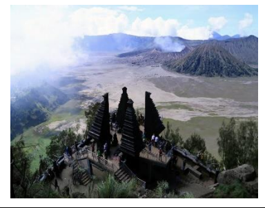
Seruni Point, before check in the Hotel, we can do sightseeing