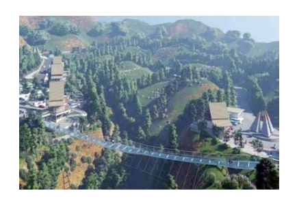
Jembatan Kaca at Seruni Point

Before checking in the hotel, at this afternoon, we can d visit our few partnership hotels there, one of them is Yoschi Pondok for telling about Tengger History (if it's available), then we can go to Jiwa Jawa Hotel, to see all about Bromo pictures trough the Gallery rooms would be explained all by the Receptionist Hotel Staff, remember in this right place like Jazz Gunung is usually held, Finally, we can do sightseeing into Seruni Point only for 30 minutes, if the routes going there are not jam while we can stop at Cemara Indah Hotel for having coffee, tea and snack.