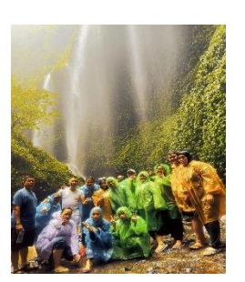
At this waterfall Area, Our Custom should change to Raincoat's

About 12:00 Pm - 16:00 Pm. we are proceeding to the Recommended Bawangan Resto for having lunch, we can enjoy about the beautiful mount Bromo slope, enjoy "Special Menu Here", looking down